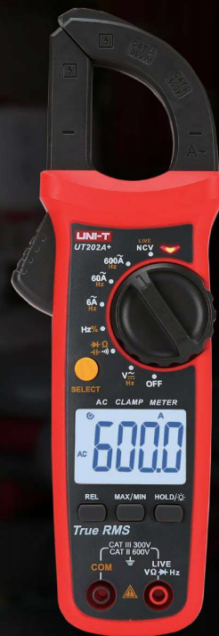
UT201+/202+/202A+ (AC current only)