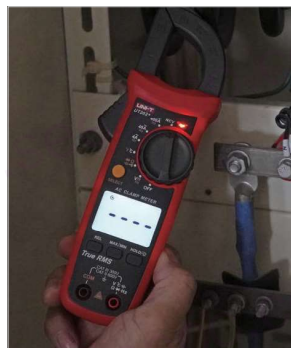
NCV multi-segment display and audio/visual alarm