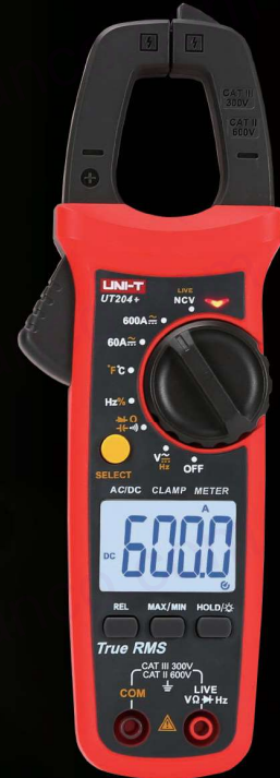
UT203+/204+ (AC/DC current)