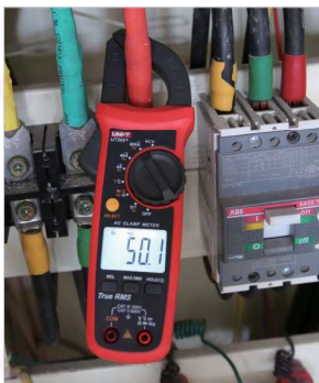
High voltage (600V) frequency measurement