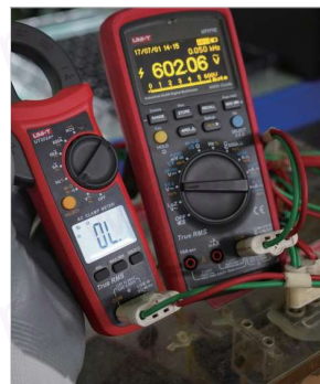
600V protection across all range